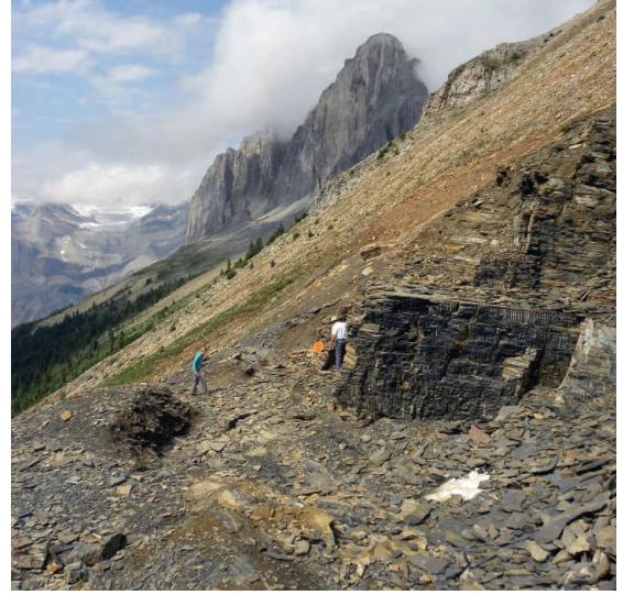
Scree slope site. Walcott quarry in the Burgess Shale, which beautifully preserves soft-bodied animals from shortly after the Cambrian explosion.

The reviewer is at the Department of Integrative Biology and Director of the Museum of Paleontology, University of California, Berkeley, CA 94720–4780, USA. E-mail: crmarshall@berkeley.edu