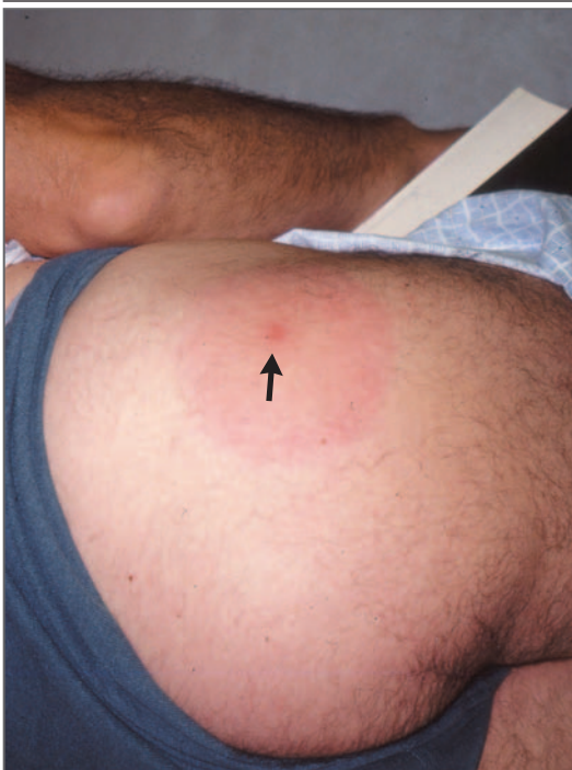
Figure 2. A Single Erythema Migrans Lesion (Paired Consecutive Episode 11).

The central punctum (arrow) is shown. This was the patient's third episode of erythema migrans.